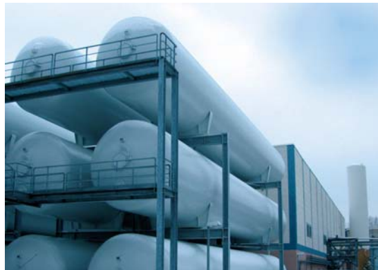
Cooling plant with helium reservoirs

Particle scientists are trying to pry more and more secrets from nature by substantially increasing the energy level of particles through speeding them up and then smashing them together. Sounds like fun! However, accelerating particles requires two ingredients. First, you need lots of power and second, you need superconducting accelerator components that operate at a temperature that is very close to absolute zero degrees Kelvin. These cryogenic temperatures are attained in Germany's largest refrigeration plant that was built in the mid-80's. This cryogenic plant continually produces liquid helium at 4.3o Kelvin to cool the superconducting electromagnets. In the past, this cryogenic facility provided the cooling agents for the 6.3 kilometer (about 4 miles) spanning HERA accelerator ring. Today, the facility efficiently produces liquid Helium for an x-ray laser project that has even lower temperature needs of 1.8 Kelvin.