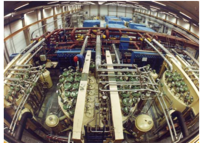
Inside view of the cooling plant

experiments. In the near future, the cryogenic system will cool the 3.4 km (2.11 miles) European X-Ray Laser Project (XFEL) that is currently under construction. When finished in 2014, this laser will provide the world's brightest x-ray beam.